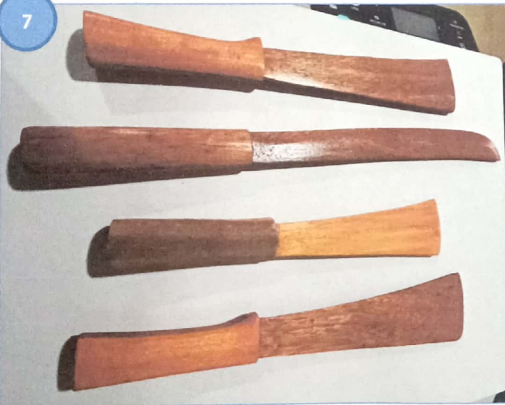
Chempui (Dao) Set

Spec: 1. Chempui: 1.7ft (1pc) 2. Chempui 1.2ft (1pc) 3. Chempui 1.3ft (2pcs) Material: Wood