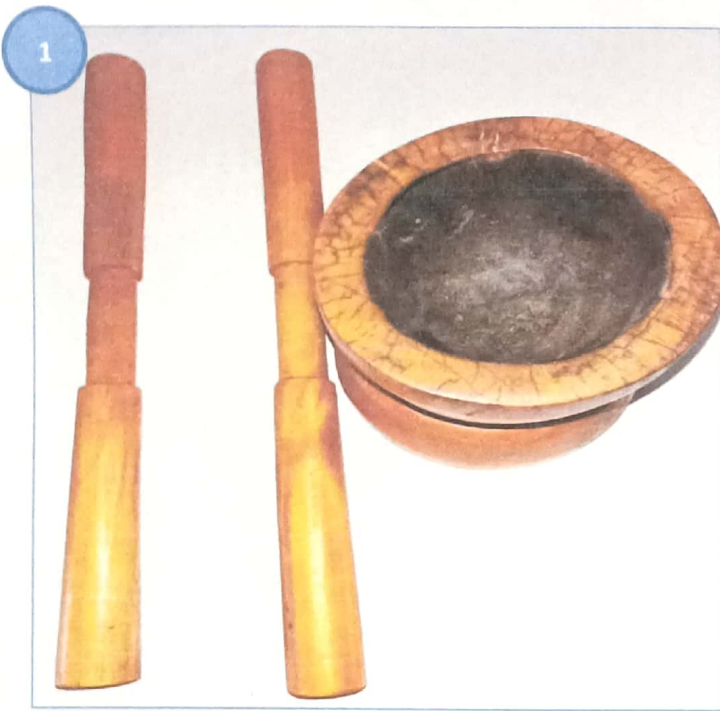
Sum leh Suk (Pestle & Mortar)