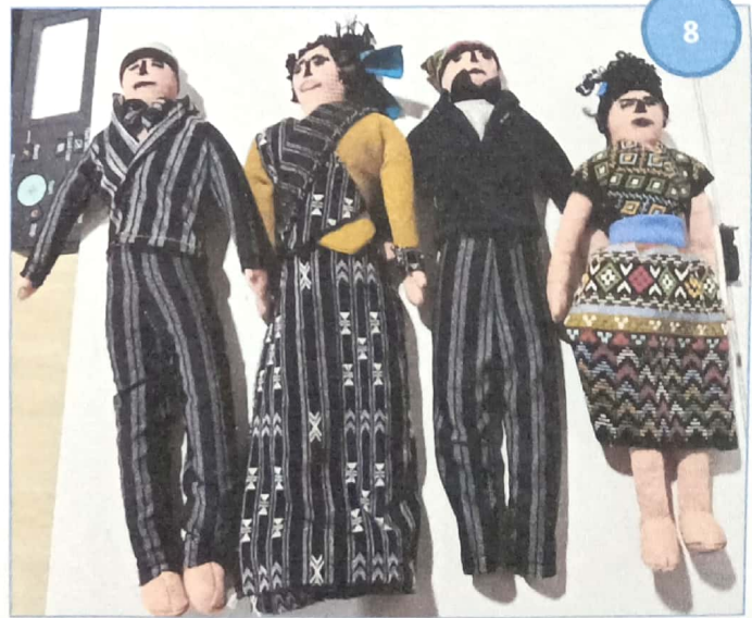
Nautelem (Traditionally dressed Soft-toys) Set

Spec: 1. Nautelem: 1.7ft (2sets) Material: Wool, Cotton