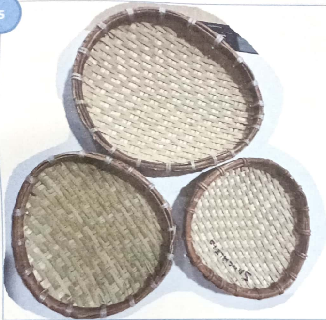
Thlangra (Winnowing Tray-3 pcs)

Spec: 2ft, 3ft & 4ft. Circumference Material: Bamboo